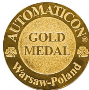
Asix.Evo 10 awarded with AUTOMATICON 2019 Gold Medal